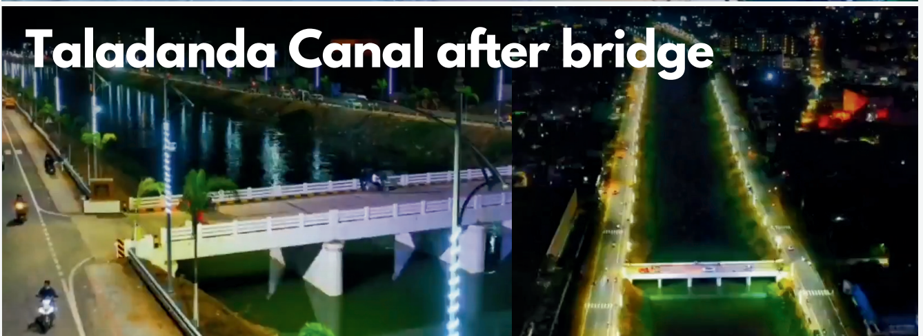
Jobra-Taladanda Bridge changed the place while cutting down travel time